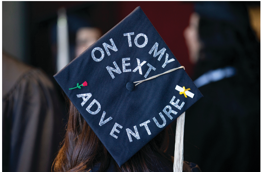
Genetics, development and cell biology graduates are on to their next adventures.